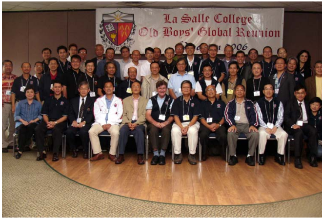
Group picture after World Conference