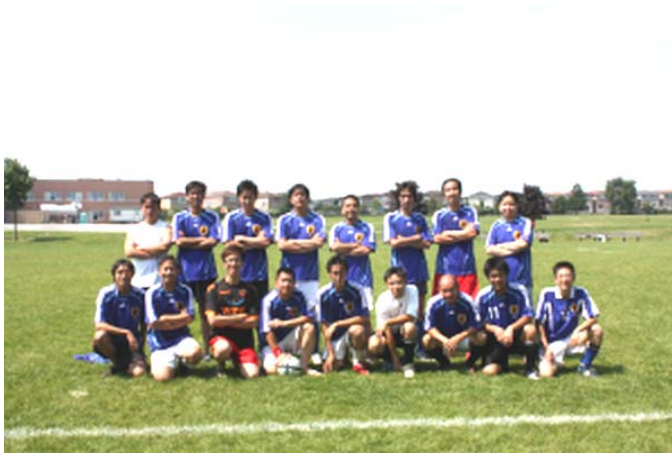
Soccer Team Picture