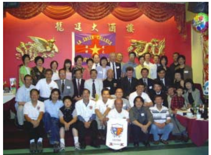
Group picture during dinner reception, 2004