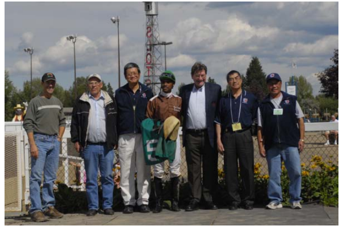
Global Reunion Cup Horse Racing Prize-giving Ceremony