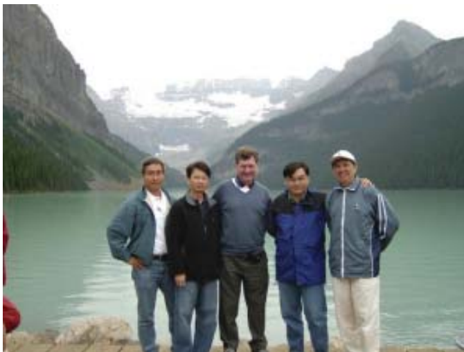
Pictured in front of Lake Louise, Banff, 2004