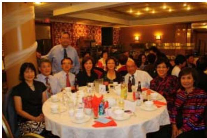
LaSallians at the reception