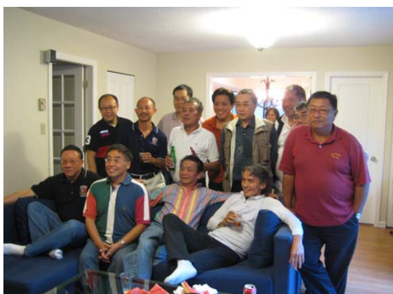
Group photo prior to school-song singing