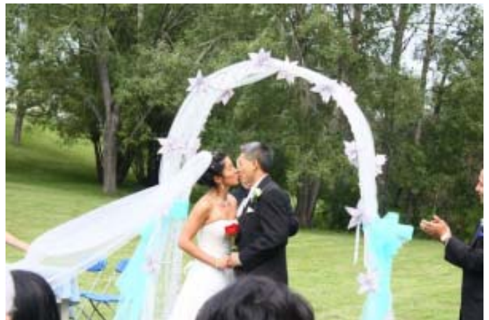
A memorable moment!